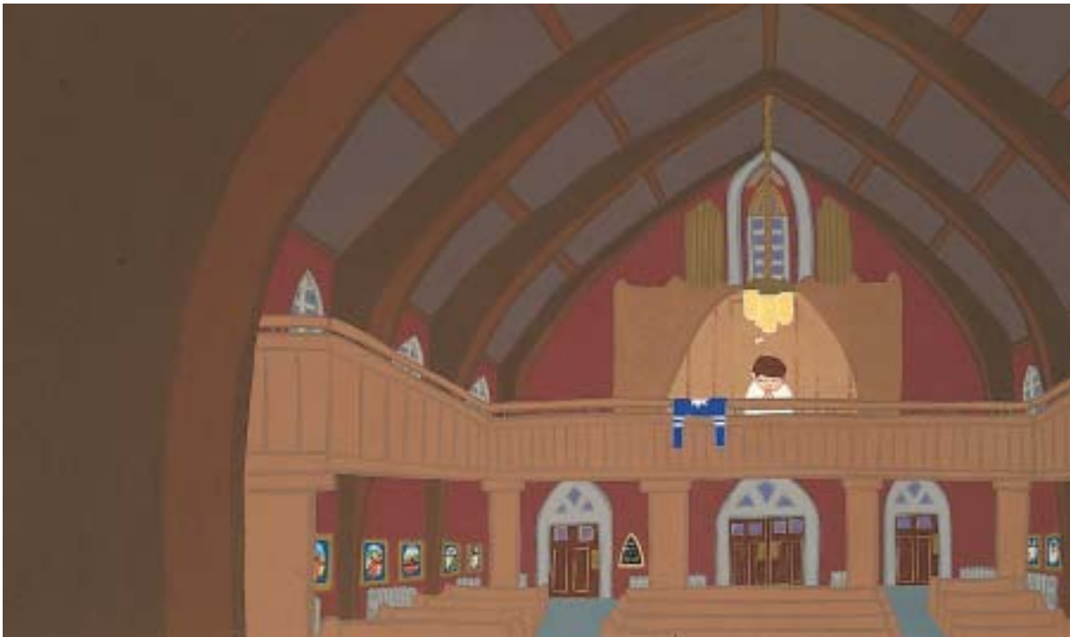
Taken from The Hockey Sweater ©1984 Sheldon Cohen: illustrations published by Tundra Books.

My mother had pulled the blue and white Toronto Maple Leafs sweater over my head and put my arms into the sleeves. She pulled